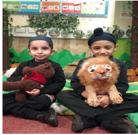
Pyjama Fun Day